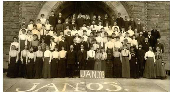
The Central High School class of 1903.

Central High School (CHS) was originally located at the intersection of Warren Avenue and Cass Avenue in Detroit. It was the successor to Capitol High School, the first high school in Detroit, founded in 1858. CHS began to offer college courses in 1913, and this program evolved into the Detroit Junior College, which became the City College of Detroit, Wayne University, and finally Wayne State University. In 1925, CHS relocated to 2425 Tuxedo Street in Detroit. It now operates as Central Collegiate Academy. The Central High School Records consist primarily of yearbooks and student publications of the Detroit Central High School for the years 1902 - 2004.