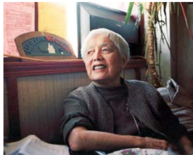
Grace Lee Boggs, whose collection is housed at the Reuther Library, was the focus of the award-winning documentary American Revolutionary: The Evolution of Grace Lee Boggs .

Several PBS documentaries and series used photographs from our collections to illustrate historical and cultural topics,