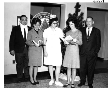
AFSCME members participate in the Appalachia on-the-job training program, undated.

This collection documents the planning, execution, and evaluation of the Association of Federal, Municipal, and State Employees (AFSCME) Career Development Program, 1966-1975, which primarily involved the Hospital Career Development Program (HCDP). HCDP developed and implemented career ladders training curricula for hospital employees. The records are composed of correspondence, reports, meeting minutes, curricula, job descriptions, organizational charts, contracts, releases, news clippings, lesson plans, course schedules, graduation invitations and announcements, recruitment material, newsletters, and a small number of photographs.