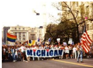
SEMGLA members join in the March on Washington for Lesbian, Gay and Bi Equal Rights, April 25, 1993.