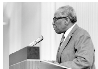
George W. Crockett, Jr.

George W. Crockett, Jr. was one of Detroit's leading African American jurists. He took a serious interest in the administration of the Constitution and representation of his clients and constituents as a lawyer, judge and congressman even when his decisions were controversial.