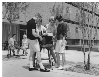
Students barbeque in front of the Joy Dormitory, c. 1960s.

In the 1970s, subsidies were offered to graduate students with a high level of academic ability. The South End reported the subsidy program was developed to dispel the notion that Wayne was “too expensive.” At a time when federal funding was low, this was a welcome offer. In 1979, there were approximately nine hundred seventy-five units available on campus. This accounted for less than three percent of the total student body.