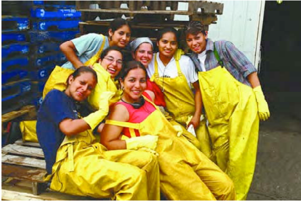
Girls at Burma Farms