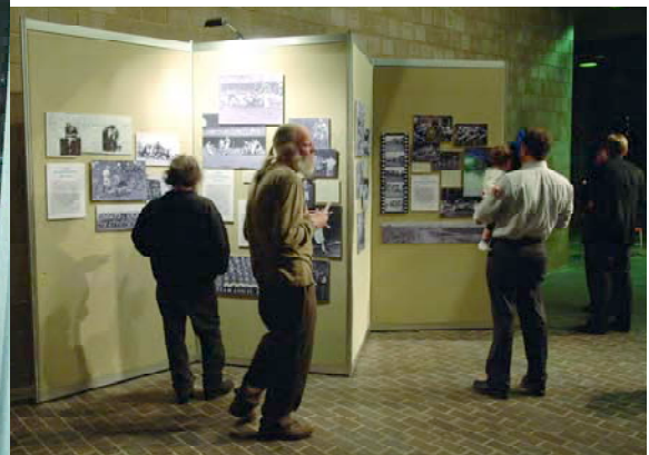
Guests enjoy the panels chronicling Lions championship years and the history of the Thanksgiving Day game.