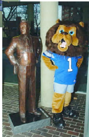
Roary strikes a pose next to the statue of Walter Reuther.