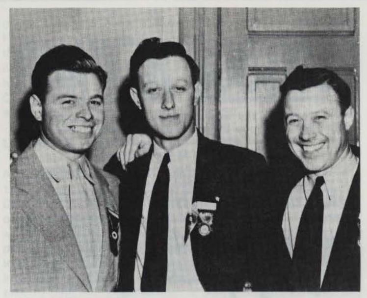
"Roy, Victor, and Walter Reuther pictured outside the office of the Mayor of Milwaukee during the 1937 UAW convention in that city."

The purpose of the project was to examine all aspects of the grievance procedure using the United Auto Workers union as a representative organization and to prepare recommendations for the selection and preservation of grievance files. Copies of the final report, which was recently completed, may be obtained by writing the Archives.