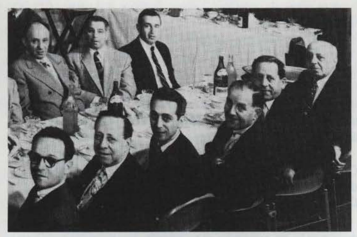
Jewish Labor Committee Meeting (1956)

this collection covers activities in the Detroit area with files concerning such groups as the Detroit Round Table, the Congress of Racial Equality (CORE); Greater Detroit Committee for Fair