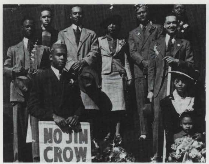
Early gathering of Detroit NAACP (Coleman A. Young, 2nd from top on right)

The NAACP was established in 1910 to help Negro citizens secure their rights, obtain legal justice and to gain equal economic, social and political opportunities.