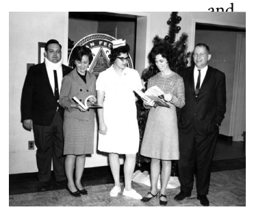
AFSCME members participate in the Appalachia on-the-job training program, undated.

implemented career ladders training curricula for hospital employees. The records are composed of correspondence, ports, meeting minutes, curricula, job descriptions, ganizational charts, contracts, releases, news clippings, lesson plans, course schedules, graduation invitations and announcements, recruitment material, newsletters, and a small number of photographs.