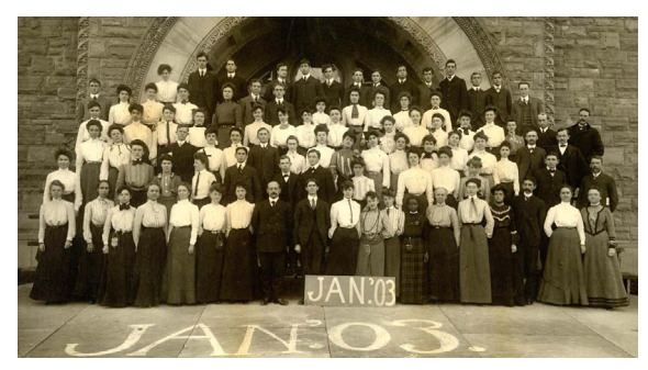
The Central High School class of 1903.

Central High School (CHS) was originally located at the intersection of Warren Avenue and Cass Avenue in Detroit. It was the successor to Capitol High School, the first high school in Detroit, founded in 1858. CHS began to offer college courses in 1913, and this program evolved into the Detroit Junior College, which became the City College of Detroit, Wayne University, and finally Wayne State University. In 1925, CHS relocated to 2425 Tuxedo Street in Detroit. It now operates as Central Collegiate Academy. The Central High School Records consist primarily of yearbooks and student publications of the Detroit Central High School for the years 1902 - 2004.