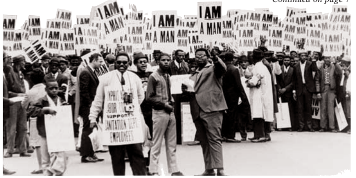
Strikers gather for a demonstration holding the now famous picket signs, January 1968.