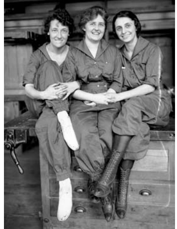
(Above) Women workers employed during World War I take a break from assembling cars, 1918.

(Right) The Polish in Hamtramck make donations in a grocery store for Poland's war effort, 14 September 1939.