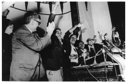
Jerry Wurf, AFSCME president and officers of Local 1733 celebrate the contract ratification vote,

Memphis ministers formed a group to support the strikers called the Community on the Move for Equality (COME). COME called for a boycott of all downtown businesses and the two daily newspapers. COME also brought the strike to the