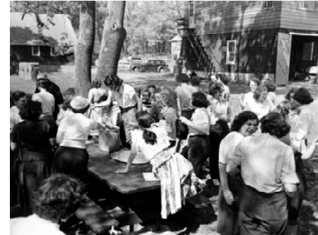
SWE members at a picnic at Green Engineering Camp of the Cooper Union during the May 27-28, 1950 founding meeting of SWE.

SWE became a national organization on May 27-28, 1950. Throughout its history, the Society's main focus has been career guidance using conferences, scholarships, and awards. SWE also used other