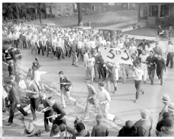
Members of the Class of 1933 proudly hold up their banner in a parade around campus.