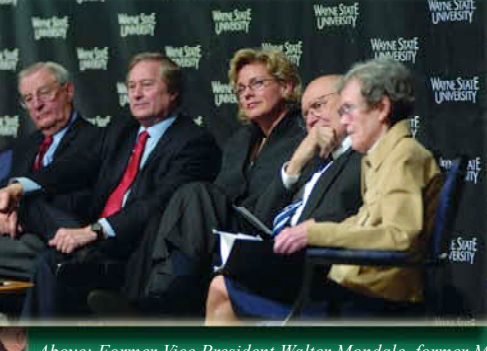
Above: Former UAW President, Owen Bieber speaks with former Michigan Senator Donald Riegle.