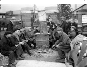
UAW members during the strike against Kelsey-Hayes Wheel Company in Detroit, December 1936.

1970 in a tragic plane crash. The UAW reached a peak membership of 1.5 million in 1978. However, the union also faced major challenges, including the oil crisis in 1974 that created a greater demand for smaller vehicles. The increase in foreign competition contributed to declining sales of U.S. vehicles and layoffs for UAW autoworkers.