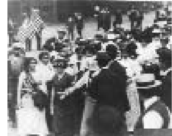
Striking silk workers on their way to New York City's Madison Square Garden to perform in "The Pageant of the Paterson Strike," 1913

social reformers, many of them women. The struggle for social justice, whether waged by organized labor, the women's equality movement or community activists, raised women's political consciousness and gave them the organizational and leadership skills needed to solve some of society's most pressing problems. HEAR ME